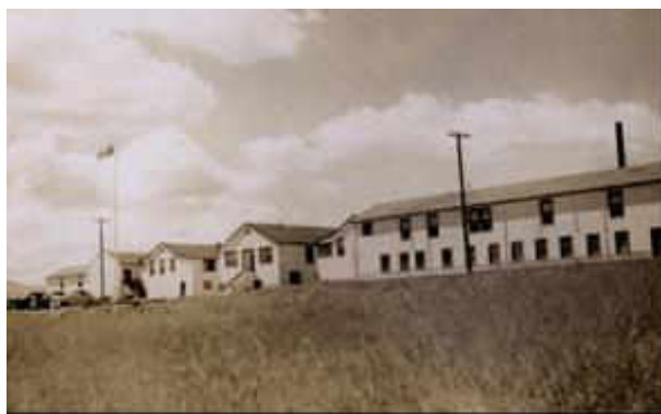
Nanaimo Indian Hospital, circa 1948

'Indian residential school' and the Nanaimo Indian Hospital (below)